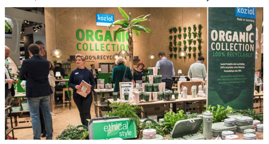
The Ethical Style label is currently held by 248 exhibitors.

production. The Ethical Style Guide will be of special interest to anyone wanting to find products and innovative approaches that excel in matters of sustainability. Ambiente exhibitors can apply for entries in the catalogue until 7 November. The selection will be made by the Ethical Style Expert Jury, a committee composed of independent members. Successful applicants will be listed in the catalogue for three years. In addition, their stands will be marked with an Ethical Style label.